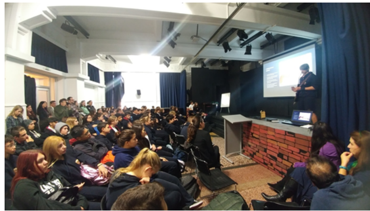
Emilios Rombotis: The guitar as a model: how strings make sound?