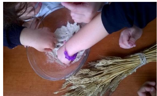
Grade 1 trip to Farm