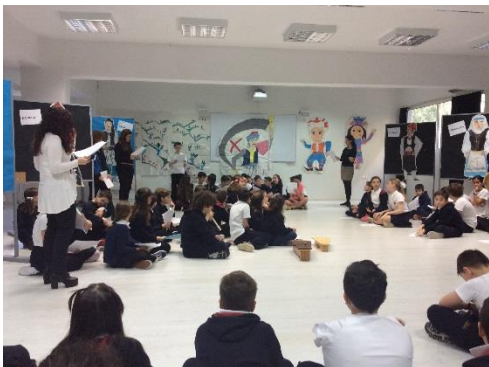
Greek Independence Day