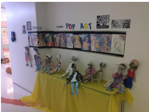
Art Grade 6

There is never an appropriate time to thank the many teachers and administration that were involved in our school program. I would, however, like to take this opportunity to thank them for their hard work and wonderful collaboration as well as to wish them a restful summer break as we look