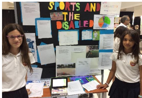
6 th Grade Exhibition