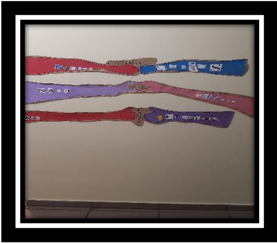
Figure 5a: Grade 2 Connection to Unit Art Activity. Students inquired into shadows and the relationship between shadows and figures.