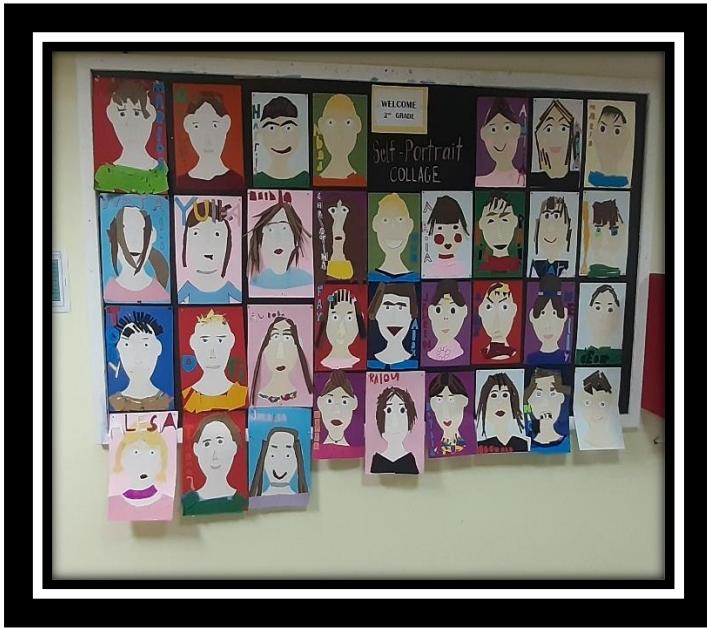
Figure 1: Grade 1 Transdisciplinary Theme: Who We Are. Students created self-portraits.