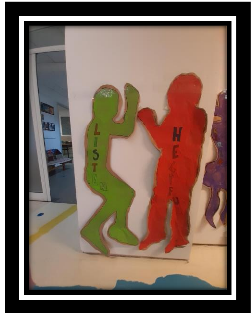
Figure 5b: Grade 2 Connection to Unit Art Activity. Students inquired into shadows and the relationship between shadows and figures.