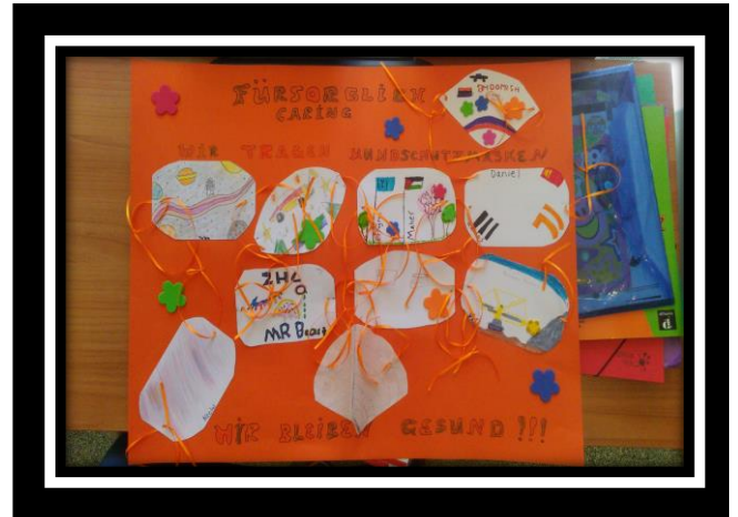
Figure 2: Grade 6 German; Caring around the world