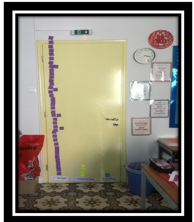
Figure 4: Grade 4-Math and Science Interconnection to Unit: 'Humans Have a Direct Impact on the World's Oceans. Students created a graph identifying the amount of saltwater in comparison to fresh water around the world.