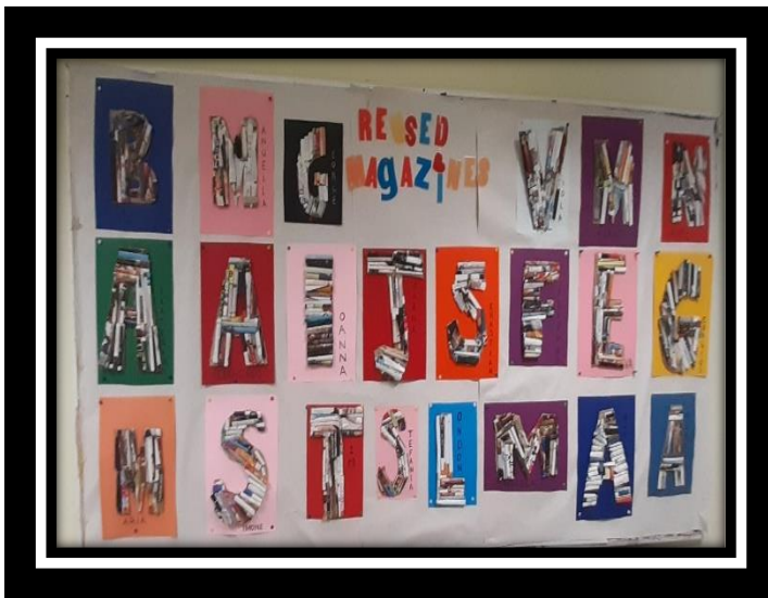
Figure 3: Grade 1 Art, Transdisciplinary Theme: Sharing the Planet. Students reused magazines to create the initial letter of their name.