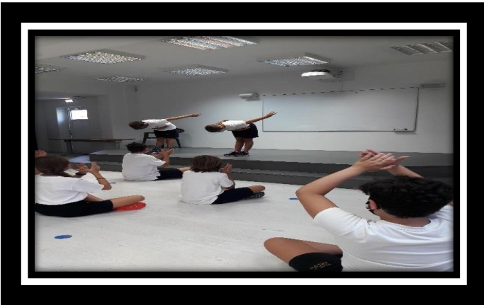
Figure 6: Grade 5A Drama: Profile of the Month: Caring. We applaud at the end of performances to show our fellow actors that we care.