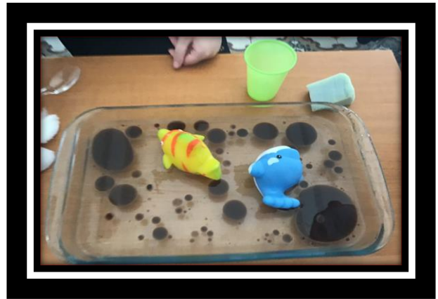
Figure 9: Grade 4 Science "Oil Spill" Experiment relating to the line of inquiry "The impact of humans on the ocean environment."