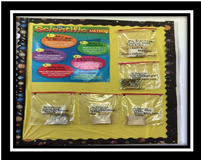
Figure 8: Now more than ever, we realize how important it is to keep our hands clean and follow all the necessary procedures to protect ourselves and stay healthy. In connection to learning about the scientific method, this valuable life skill was demonstrated to Grade 5 students by conducting the "Bread Experiment". Students applied hand sanitizer, soap, water as well as hand sprays to their hands. They then touched sliced bread and placed the slices into individual zip-lock bags. Over the course of a month, the students observed the changes which occurred to the bread. The results were impressive, and the students were able to connect to the importance of personal hygiene through inquiry and the scientific method.